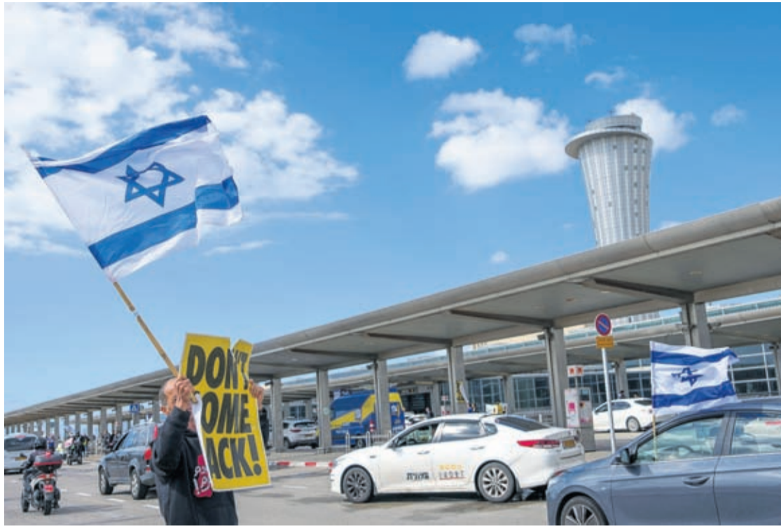
A man holds a sign , don't come back, and an Israeli flag during protest against plans by Prime Minister Benjamin Netanyahu's government to overhaul the judicial system, ahead of Netanyahu's visit to Germany in Ben Gurion airport near Tel Aviv, Israel, Wednesday, March 15, 2023.

Eric Fingerhut, the president and chief executive of the Jewish Federations, said the 24-hour visit, coming at short notice, illustrated the "grave concern and worry" the Israeli debate has raised among American Jews. Netanyahu's allies, a collection of ultra-Orthodox and ultranationalist parties, launched the overhaul in January days after taking office. The program aims to weaken Israel's Supreme Court and would give Netanyahu's allies control